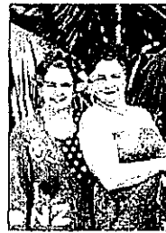
Topp Twins: take a harky.

■ Untouchable Girls is the very funny, very moving story of two extraordinary Kiwis. This documentary about the lives of New Zealand's favourite yodelling, lesbian twins, fools and Lynda Topp, covers everything from their idyllic rural childhood to their political activism to fighting cancer. The Topp parents, who seem to be top parents, are among the good and the great interviewed. The ex-pat Kiwi satirist formerly known as Fred Dagg, John Clarke, says admiringly: "They're prepared to do anything - they're relatively shameless."