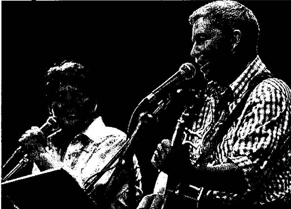
The Topp Twins: Untouchable Girls is now screening.