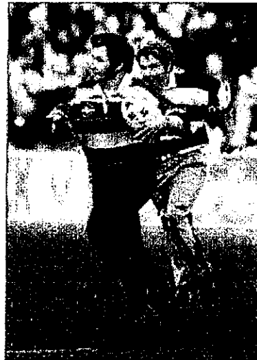
THE KENS: The Topp Twins' alter egos perform the pre-match entertainment at Waikato Stadium.

after our anti-Springbok stage when Ken and Ken came along, for them to ask us to be the pre-show entertainment we felt we had come full circle . . . We were never trying to stop rugby in 1981 we were trying to stop apartheid – so it was really great when Ken and Ken got to run down that field,” says Lynda