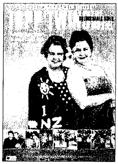
TOPP FILM: The Topp Twins film has broken records for a New Zealand documentary.

The film chronicles the twins' life from singing to the cows on their father's Huntly farm to busking in the streets of Auckland, performing at the Rugby World Cup and London's West End stage and through to their 1990s TV show and on. However because of the twins'